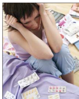
Self poisoning is the second most common method (after self cutting) for deliberate self harm by adolescents